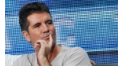
Simon Cowell's young son upsets 'grumpy man' during flight to Miami