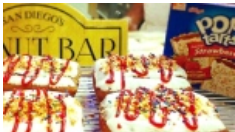
Giant Pop Tart doughnut is racking up sweet sales for Southern California baker