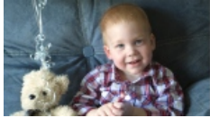
Toddler pulled from creek, revived after 101 minutes of CPR