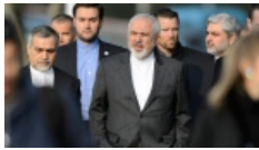
Iran nuclear talks break unexpectedly, official says deal close