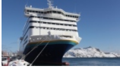
Marine Atlantic ferry Blue Puttees remains stuck in ice off Cape Breton