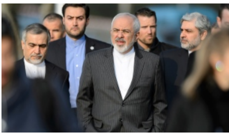
Iran nuclear talks break unexpectedly, official says deal close