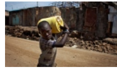
UN warns of 40 per cent water shortfall by 2030