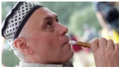
Water pipes can be more harmful than cigarettes: experts