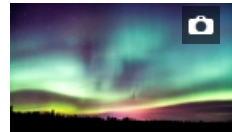
Northern lights ripple across Canadian skies