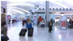
Protest at Pearson airport could cause delays