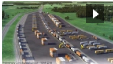
On the right track? Ontario town taking on CN Rail