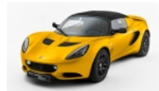
Lotus marks 20 years of the Elise with anniversary model