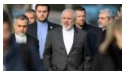
Iran nuclear talks break unexpectedly, official says deal close