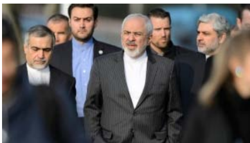
Iran nuclear talks break unexpectedly, official says deal close