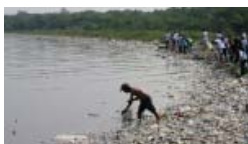
Containers of Canadian garbage languishing in Philippines port