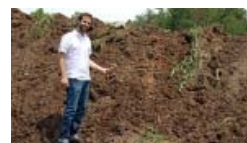
Toronto Zoo backs eco-friendly poo-to-power plant