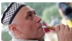
Water pipes can be more harmful than cigarettes: experts