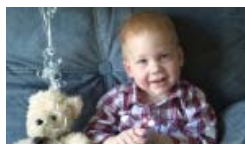
Toddler pulled from creek, revived after 101 minutes of CPR