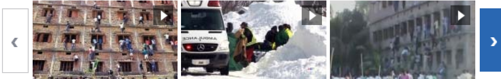
Canada AM: Parents scale walls to help kids cheat