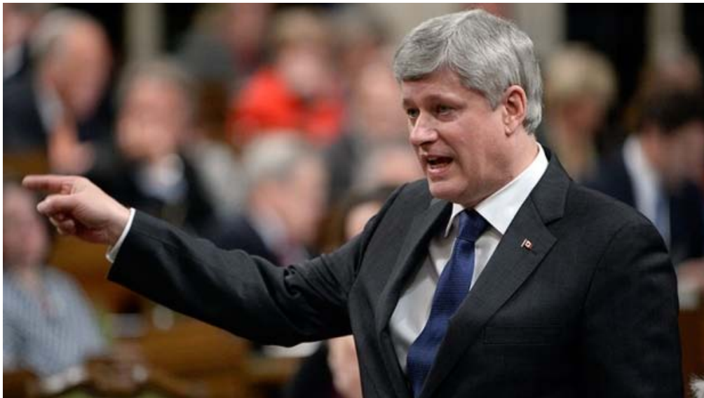
Prime Minister Stephen Harper answers a question during Question Period in the House of Commons in Ottawa on Tuesday, March 10, 2015