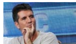
Simon Cowell's young son upsets 'grumpy man' during flight to Miami