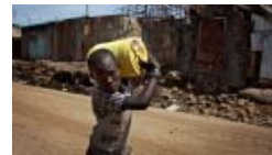
UN warns of 40 per cent water shortfall by 2030