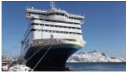
Marine Atlantic ferry Blue Puttees remains stuck in ice off Cape Breton