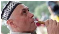
Water pipes can be more harmful than cigarettes: experts