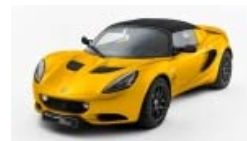
Lotus marks 20 years of the Elise with anniversary model