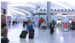
Protest at Pearson airport could cause delays