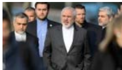
Iran nuclear talks break unexpectedly, official says deal close