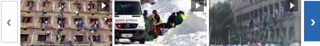
Canada AM: Parents scale walls to help kids cheat