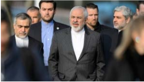
Iran nuclear talks break unexpectedly, official says deal close