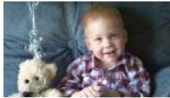
Toddler pulled from creek, revived after 101 minutes of CPR