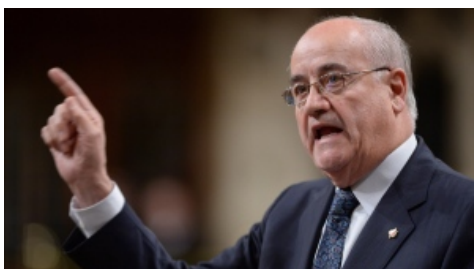
Fantino to meet a select few veterans groups in Quebec City

Nova Scotia should expand HST, introduce carbon tax: report Republicans promise to quickly resurrect Keystone XL Ex-Bloc member Mourani joins NDP, but not as MP, yet Putin receives new U.S. ambassador, hints at confrontation over Ukraine Liberals score highest, Conservatives plateau in Nanos Power Index