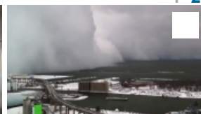
Extended: Time-lapse of Buffalo snowstorm