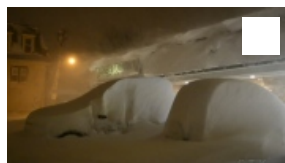
Extended: Cars and houses buried in snow