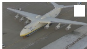
LIVE2: World's largest plane departs Toronto