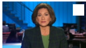
CTV National News for Wednesday, Sept. 24, 2014