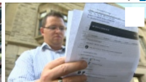
CTV Calgary: Unexpected flight change