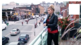
CTV Ottawa: Victim of human trafficking